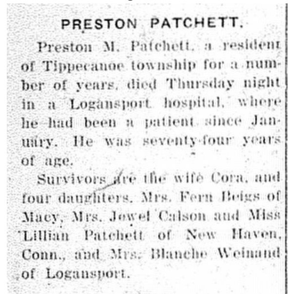
Pulaski County (IN) Democrat 4 Apr 1940: 2. Microfilm.