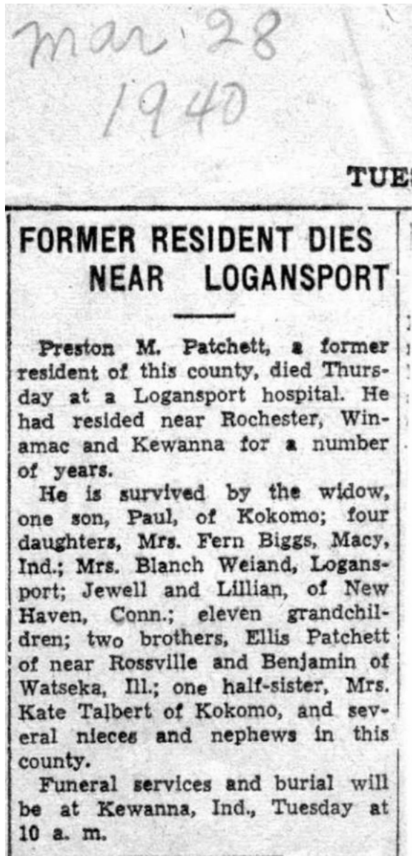
[unknown Rochester IN newspaper] Mar ? 1940.